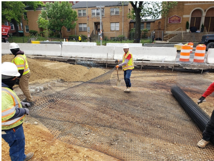
Picture No. 10 – 05/08/2020 – Geogrid and 21A stone placed and compacted in progress for the full depth excavation at NY Ave. between M St. and NJ Ave. NB. (South View)