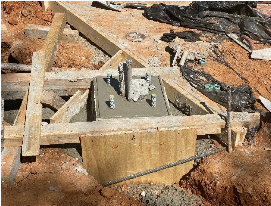
Picture No. 7 – 05/07/2020 – Installed traffic light foundation at NW corner of NY and 1st. St. NW