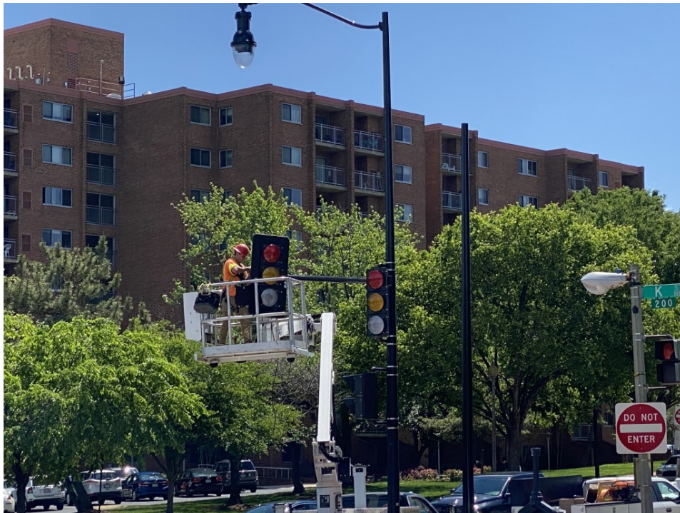
Picture No. 3 - 05/04/2020 – Traffic light installation at the SW corner of NJ Ave and K St. NW (South View)