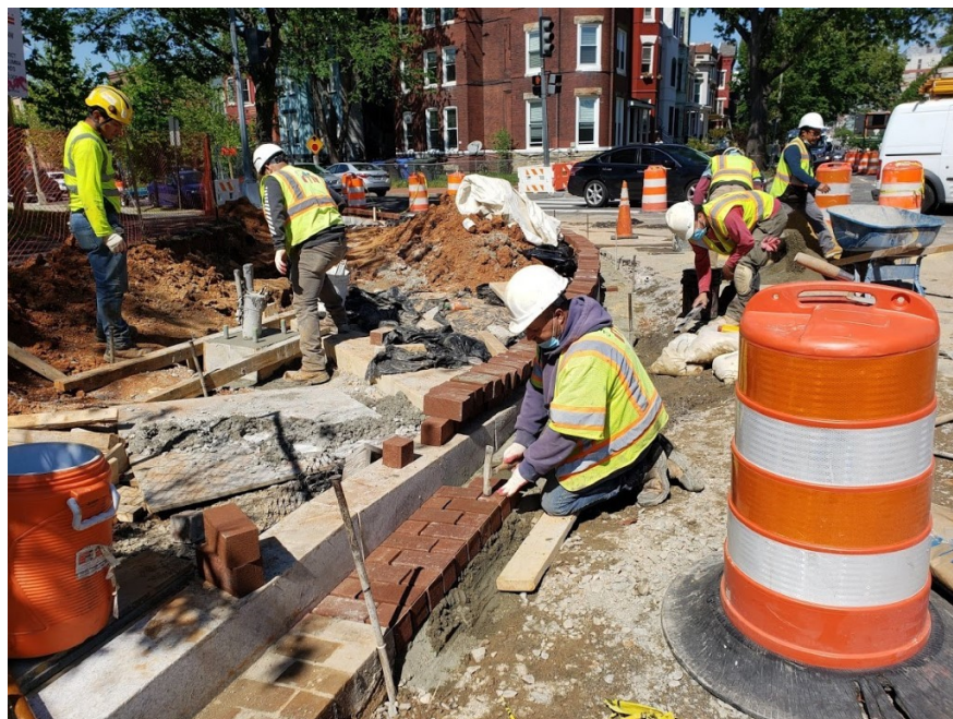
Picture No. 6 – 05/07/2020 – Brick gutter work started at NW corner of NY Ave. and 1st. St. (East view)