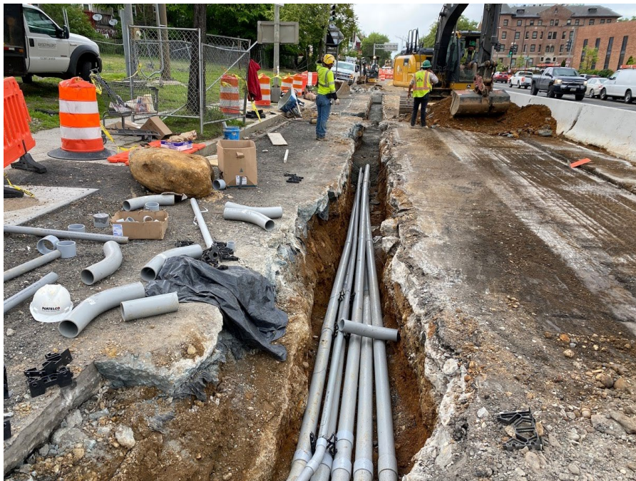
Picture No. 8 – 05/08/2020 – PVC conduit pipes installation between 3rd. St and 4th. St. NW. (East view)