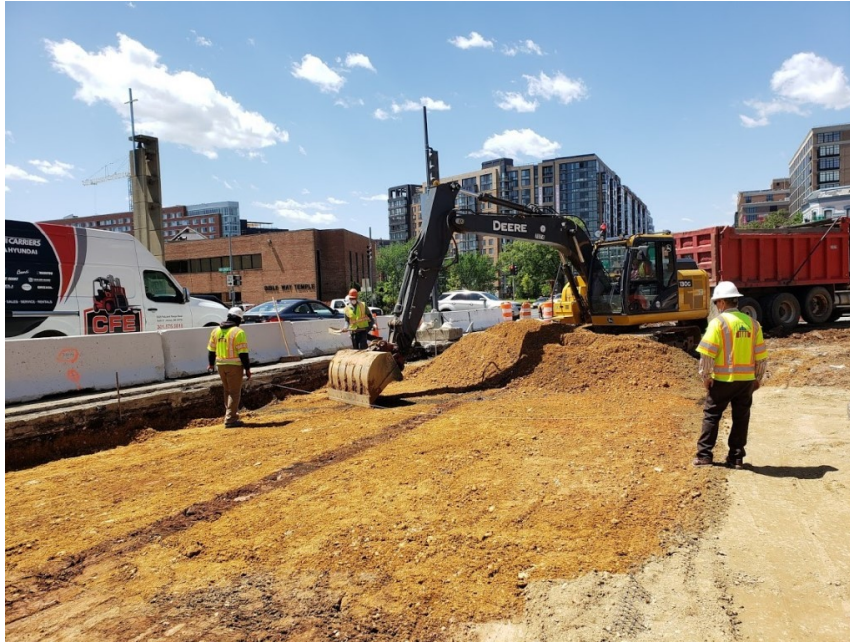
Picture No. 1: 05/04/2020 – Subgrade undercut in progress after proof rolled the section shown on photo at NY Ave. between M St. and NJ Ave. NB. (West View)