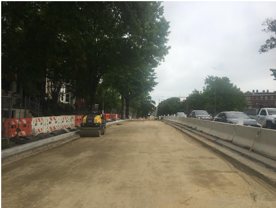
05/08/2020 – Fine grading and compacting of aggregate base on NY Ave. between First St. and NJ Ave. (East View)

Project Website: www.newjerseyaverehab.com