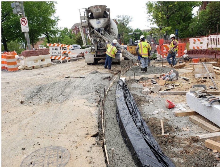
Picture No. 4 – 05/05/2020 – Installed granite curb and concrete pour in progress for the wheelchair ramp at NW corner of NY Ave. and 1st St. (West View)