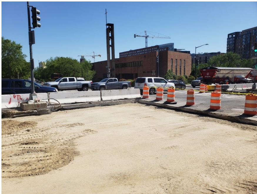
Picture No. 2: 05/04/2020 – Finished base course which was compacted and rolled with smooth steel roller at NY Ave. between NJ Ave. and M St. NB. (South View)