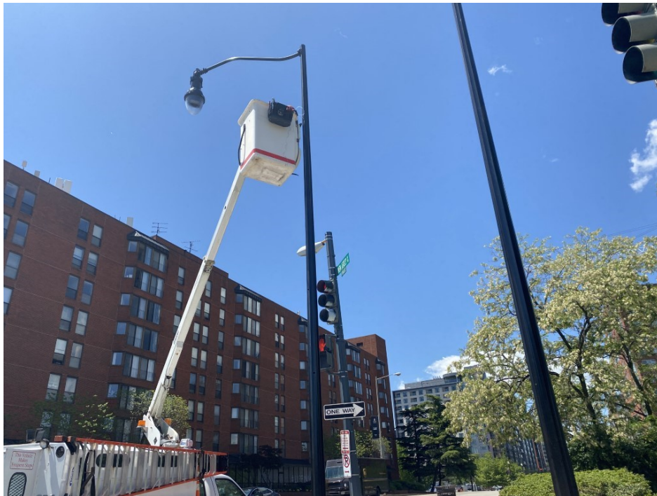
Picture No. 5 – 05/05/2020 – CCTV installation at NW corner of NJ and K St. NW (South View)