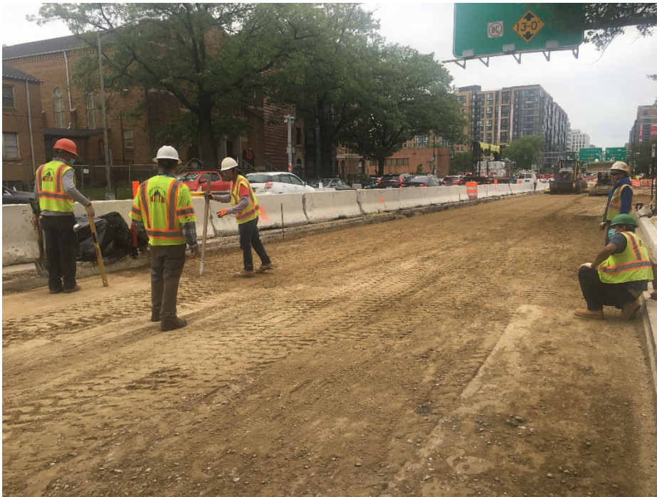
Picture No. 9 – 05/08/2020 – Fine grading and checking grades at NY Ave. between Kirby St and M St. (West View)