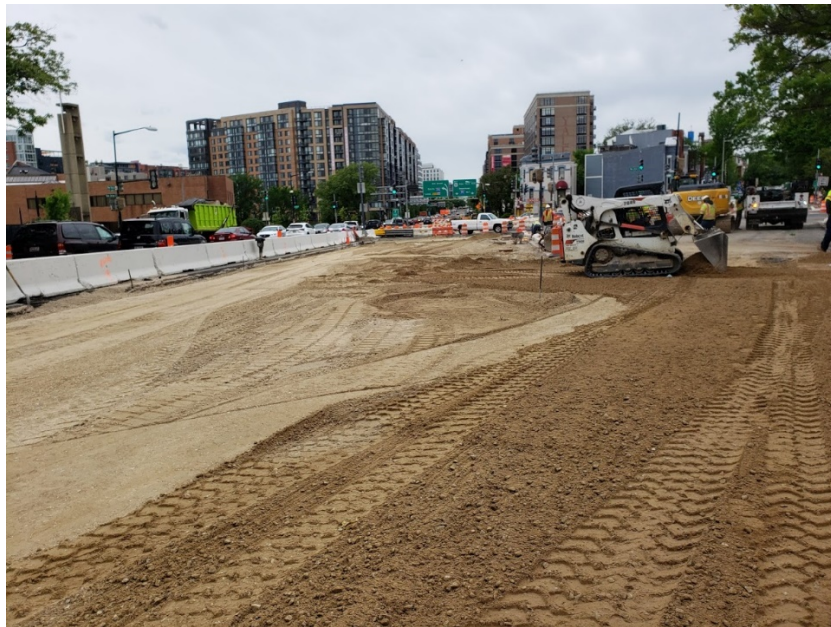
Picture No. 11 – 05/08/2020 – 21A stone placed and compacted at NY Ave. between M St. and NJ Ave. NB. (East View)